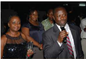
Hon. Emmanuel Armah-Kofi Buah, Minister of Energy, Ghana. Welcoming participants