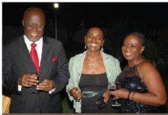
Adwoa Okyere, CEO Africa Bagg & Fmr. Ghana Minister