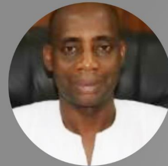
HON. MINISTER DR. SAGRE BAMBANGI