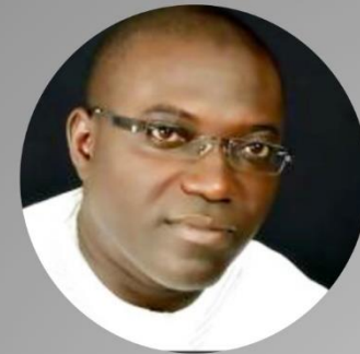
HON. MINISTER MARTIN ADJEI-MENSAH KORSAH

Deputy Minister for Regional Re-organization and Development, Ghana